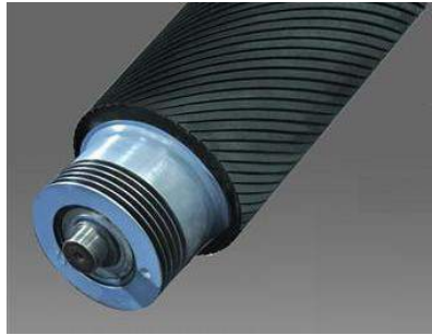
Calibrating drum: Ø210mm